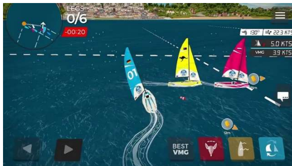
The virtual sailing