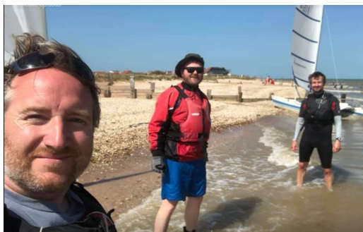
Unsupported socially distanced sailors

Using guidance from the RYA and Sport England we have developed a plan for a phased return to normality. This builds on the Overall Covid Risk Assessment for the club, the Unsupported Sailing Guidance document we issued out mid-May and provides a path to a slow re-opening. Our initial steps in May were to allow unsupported Sailing and last weekend we managed to clean the ramp. Our next stages include completing the winter works (we are asking you to stay away from the workers during this time), establishing deep cleaning routines for the club and making sure the club is ready for potential further restricted opening in July. All of these steps require thought and Risk Assessing and I'm hugely grateful to all those helping prepare controls that will keep us all safe as we ease back to some form of normality. The plan will be reviewed 2 weekly by the Covid Subcommittee and monthly by the full committee. Any updates will be shared with you and held on the website. So please take a good look at our plan and I'd appreciate any feedback or help you can provide. We are all learning as we go here!