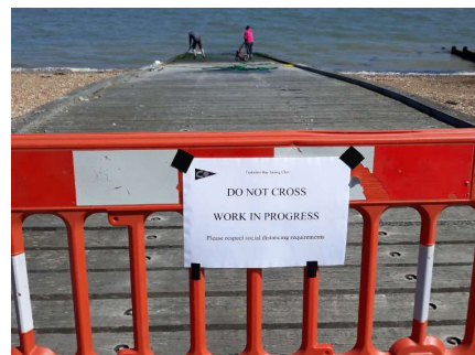
Ramp cleaning with covid-19 controls in place